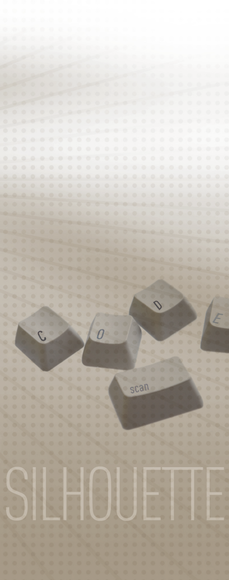
Silhouette Matched Open Source Projects Report